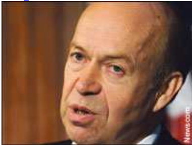
Hansen: Crushing dissent

http://www.ibdeditorials.com/IBDArticles.aspx?id=299112954905500